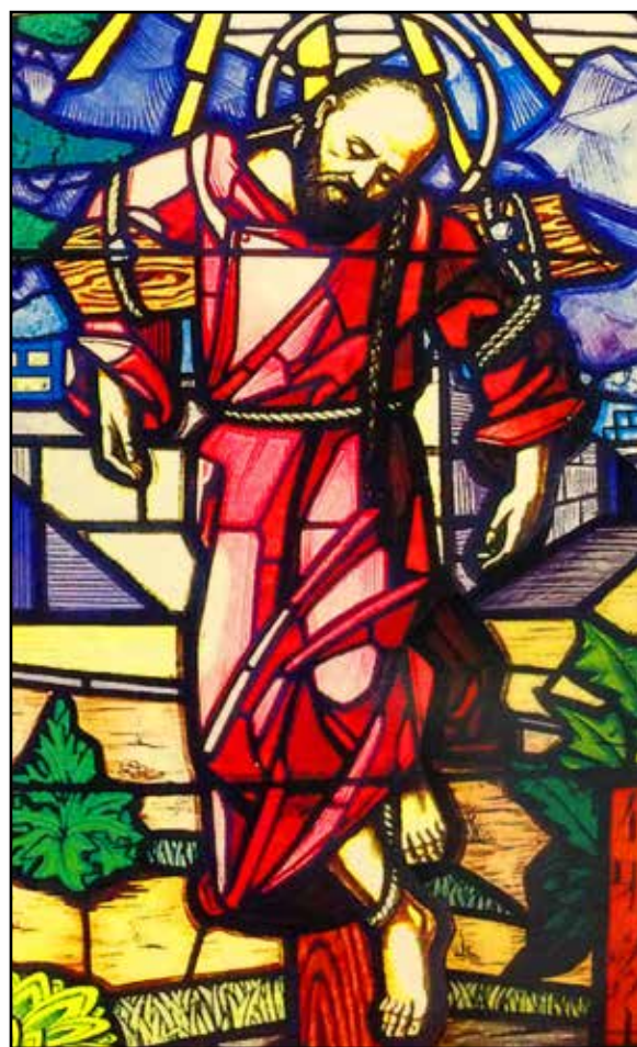
SAINT JOHN GABRIEL PERBOYRE, C.M.

with a reflection on Mercy. It will be necessary to accompany these celebrations with the profession of faith and with prayer for me (Pope Francis) and for the intentions that I bear in my heart and for the good of the Church and of the entire world."