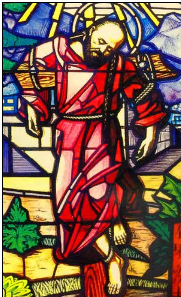
SAINT JOHN GABRIEL PERBOYRE, C.M.