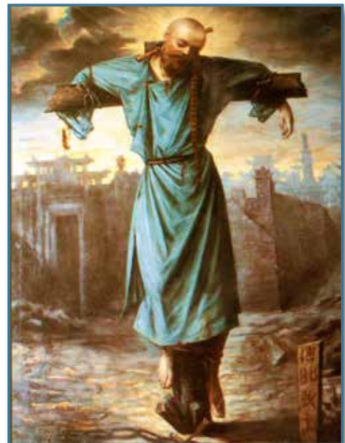
Saint John Gabriel Perboyre