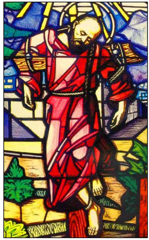
SAINT JOHN GABRIEL PERBOYRE, C.M.

For information about the trip please email the Mission Center at admin@vpmc.org