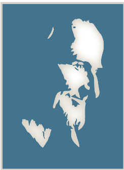
St. Vincent DePaul

It was a goal of Vincent's to eventually serve God's people in the rural and poor communities throughout the whole world. Today there are over 3,000 Vincentian priests and brothers serving in 86 countries around the world.