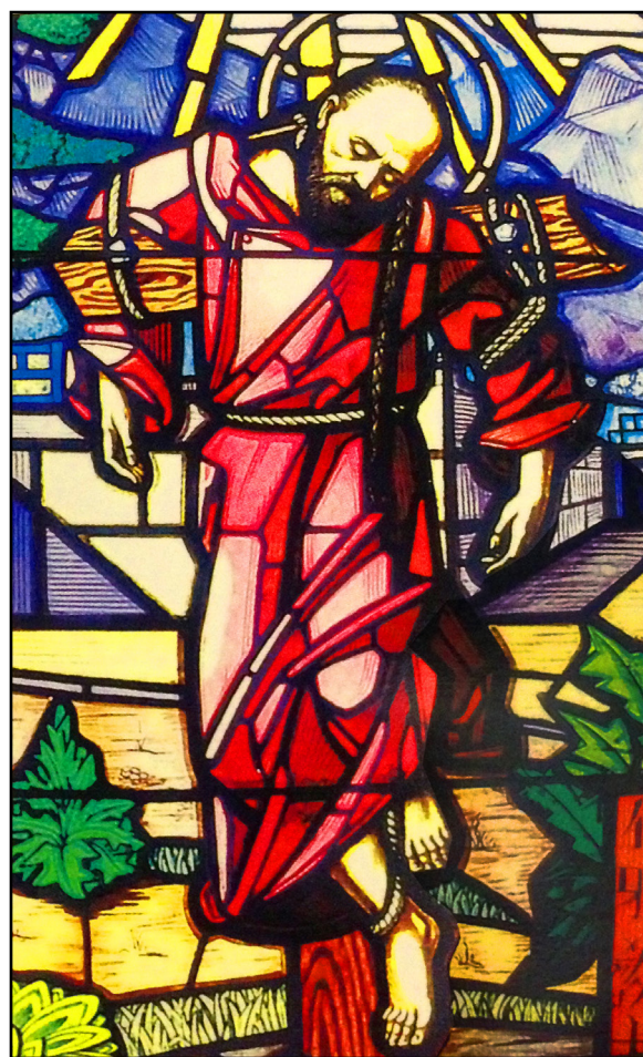
SAINT JOHN GABRIEL PERBOYRE, C.M.